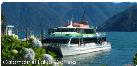
Catamaran in Lakes Crossing