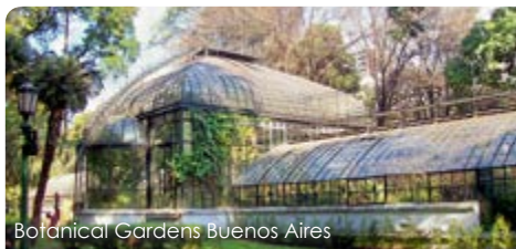
Botanical Gardens Buenos Aires