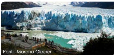
Perito Moreno Glacier