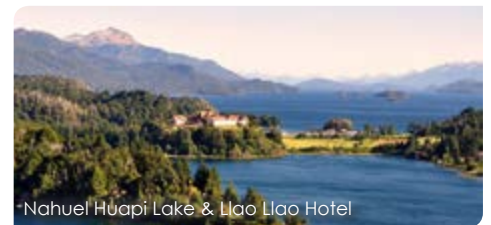
Nahuel Huapi Lake & Llaolao Hotel